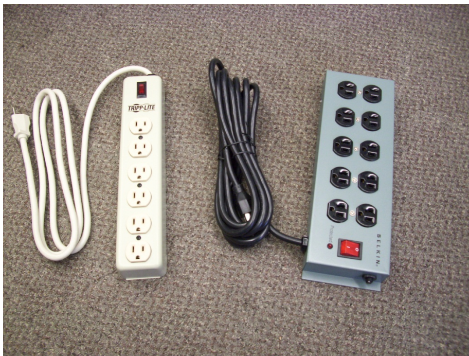
Figure 1. Multiple Outlet Strips, otherwise known as Relocatable Power Taps (RPTs).

Relocatable Power Taps or "RPT"s (a.k.a multiple outlet strips, outlet strips, strip plugs or power taps) (Figure 1) are used extensively at 120 VAC, 20A or less, to provide the connection of multiple proximate and low current loads. The premises wiring outlet from which the strip is fed is protected against overloads, and thus the strip itself is also protected if adequately wired. Maximum load on a multiple outlet strip shall not exceed that indicated by the rating label on the strip; if the strip is unlabeled consult with the Division/Section Electrical Coordinator before use. Strips rated at 15A may be fed from 20A outlets. Strips that have overcurrent protection by means of integral fuses or circuit breakers are preferred. RPTs are intended to be directly connected to a permanently installed receptacle. RPTs are not intended to be series connected (daisy-chained) to other RPTs or to be connected to extension cords. RPTs are also not intended for use at construction sites or similar locations. RPTs may be fastened to benches or racks so long as they can be removed without the use of tools.