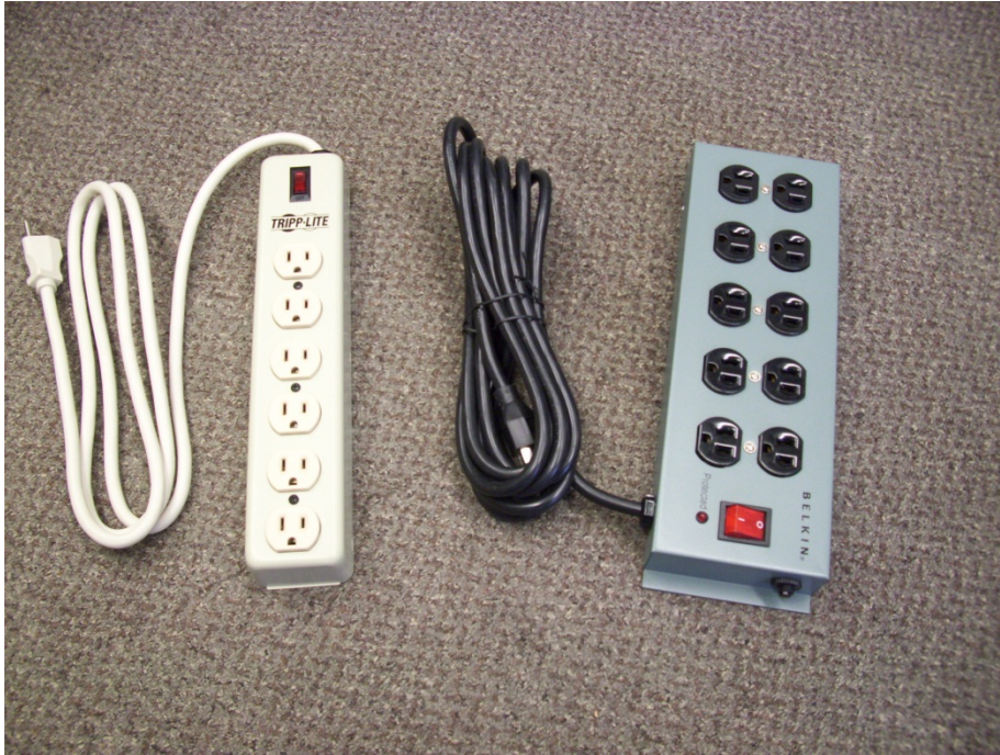
Figure 1. Multiple Outlet Strips, otherwise known as Relocatable Power Taps (RPTs).